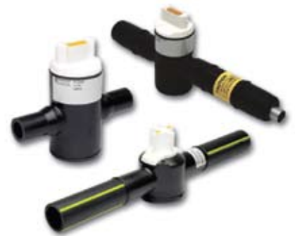
PSV™ polyethylene shut-off valves

Elster Perfection offers a complete line of tools and accessories to assist field crews during the installation of our gas distribution products. Among these items are chamfering tools and kits, PE cutters/snippers, tools for mechanical tees, protective sleeves, tubing end protectors, marking pencils, polyethylene clamping devices, moisture seals and gaskets, and a variety of riser mounting brackets.