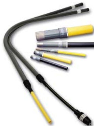
Anodeless service line risers & transition fittings