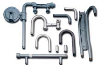
Prefabricated meter sets and steel products