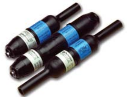
EFV excess flow valves