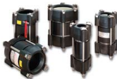
Permasert® XL large diameter mechanical couplings