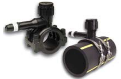
PermaLock® mechanical tapping tees