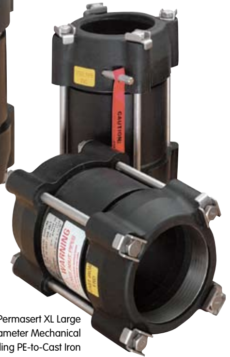
Permasert XL Large Diameter Mechanical Coupling PE-to-Cast Iron